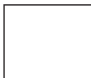
big block (great for large prints)